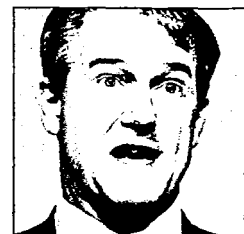
Seminar: Owen Paterson

vision of the common good inform policy decisions in a time of cuts?'