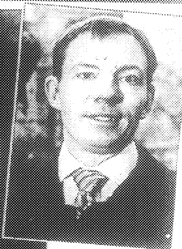
BLAME IT: Chris Bryant who is a vocal gay rights campaigner