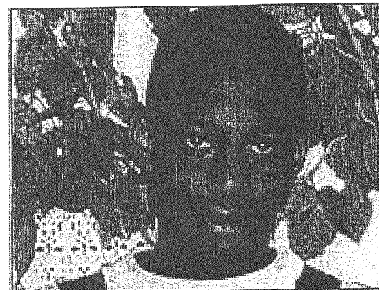
Stephen Lawrence was attacked at a bus stop in 1993