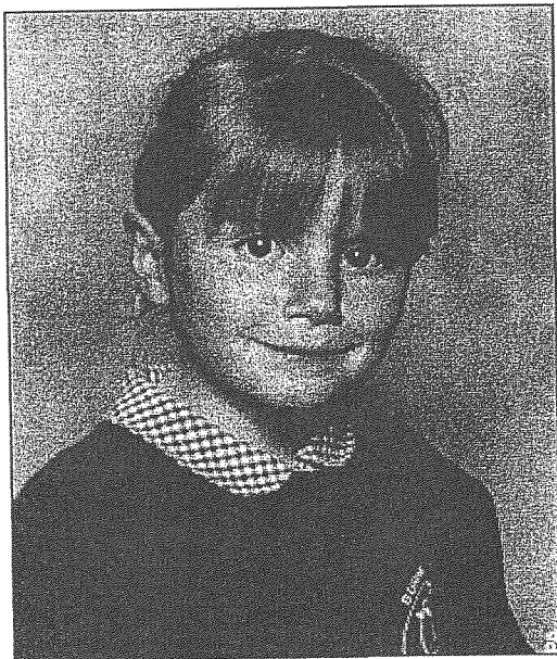
Campaigners for 'Sarah's Law' remember murdered Sarah Payne