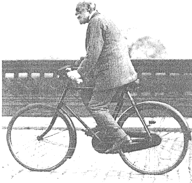
CP Scott as the people of Manchester were used to seeing him: on his bicycle