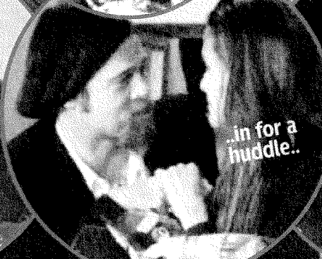
...in for a huddle..