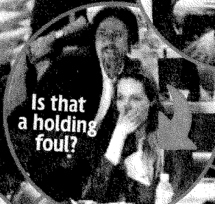
Is that a holding foul?