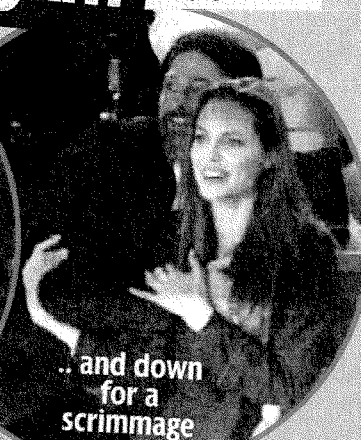
.. and down for a scrimmage