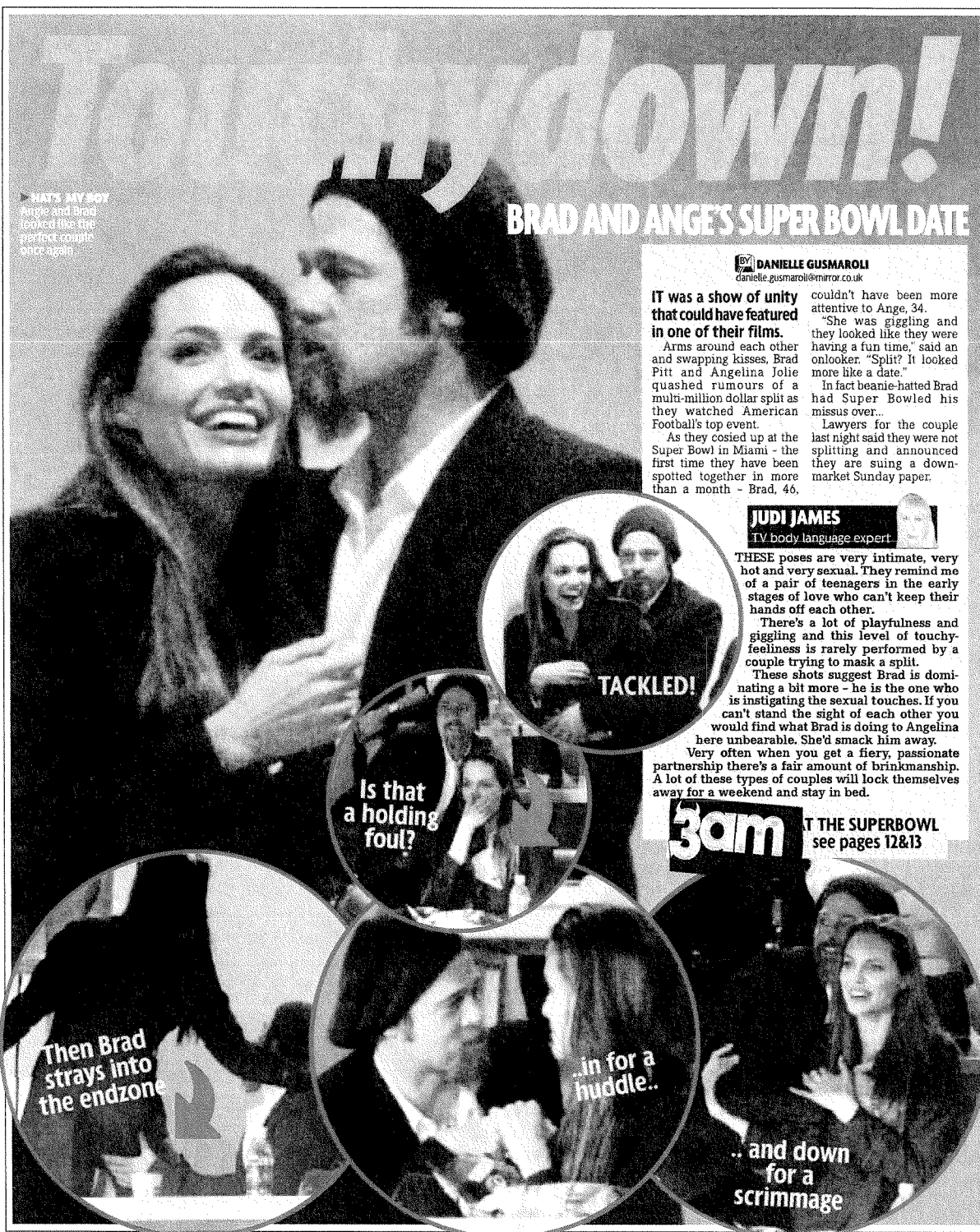
▶ HAT'S MY BOY Ange and Brad looked like the perfect couple once again

The popular actress died in December aged 75. Her character will be written out later this year.