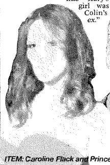
ITEM: Caroline Flack and Prince Harry