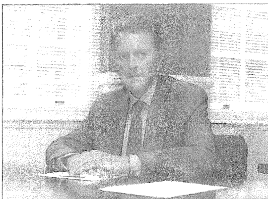
LEADING THE PANEL: Sir Christopher Meyer, chair of the Press Complaints Commission

That is all for this month, but as always if you are dissatisfied by the way the editorial staff have dealt with a complaint you can contact me and I will investigate and take it forward on your behalf. I can be contacted in writing at The Star or by email at ombudsman@eveningstar.co.uk