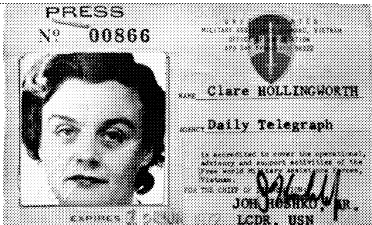
Historic example of future Paul Dacre backed system.