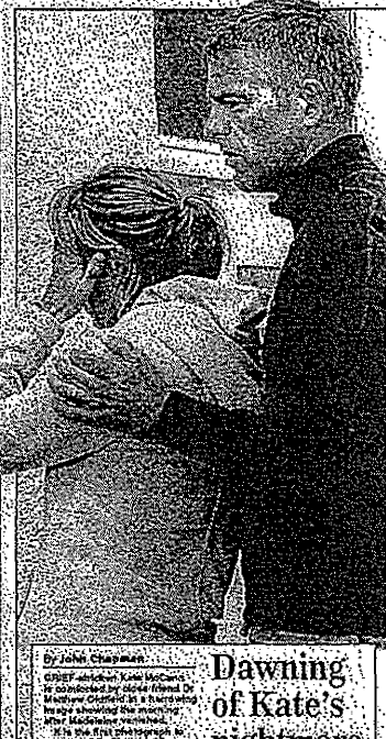
By John Chapman

Dawning of Kate's nightmare ...the abduction... the Daily Express has revealed the location of the abduction in a report that has been widely reported in the media. ...the abduction... the Daily Express has revealed the location of the abduction in a report that has been widely reported in the media. ...the abduction... the Daily Express has revealed the location of the abduction in a report that has been widely reported in the media.